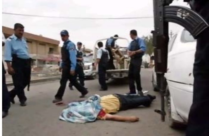
A college professor found dead in Diyala – June,2011