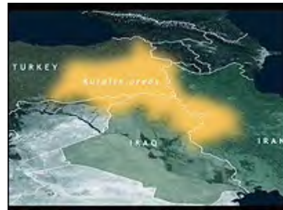
Iran and Turkey are concerned about a Kurdish state emerging in Northern Iraq

"So you reckon that if two guys from the intelligence service knew we were Israelis and they saw our passports as well, the leadership knew as well - I mean their bosses, that's natural."