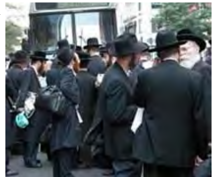
The Jews are seeking 'compensation'

The Israeli justice ministry spokesman said that the government would ask Jews in Israel and all over the world within the few coming days to present information on their purported belongings in Iraq, the Palestinian Information Center (PIC) said Saturday, August 16.