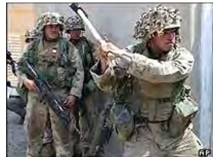
US soldiers in Iraq have been faced with revolts on more than one front

US commanders have drawn extensively on Israel's experiences in the West Bank and Gaza Strip for lessons that might be applicable to Iraq.