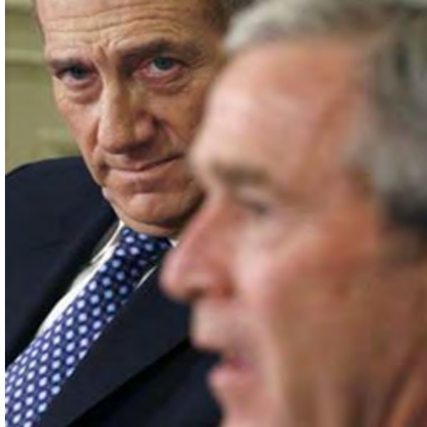
U.S. President George W. Bush and Israel's Prime Minister Ehud Olmert (L)

Forty years ago, when Israeli air and naval forces attacked and bombed the U.S. Navy intelligence ship Liberty, the thirty-four Americans who died while patriotically serving their country were buried in the cold graveyard of treachery dug by their leaders. The 172 injured