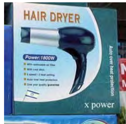
A sample of Israeli-made products now invading Iraqi markets

She wondered: "Who would have imagined that Baghdad would someday host a center serving Israeli plots and schemes?"