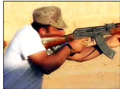
The Kurdish authorities have long been accused of being in cahoots with Israel

Israeli Government spokesman, Mark Regev, told Newsnight that the Investigations Division of the Israeli Ministry of Defence had passed the details of this case to the Israeli police to see if there had been any violation of export laws.